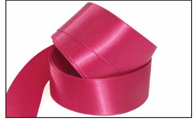
Paris Pink 470

Widths with extended lead times Approx 2-3 weeks 12mm, 15mm.