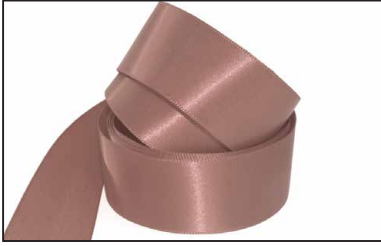
Rose Gold 330