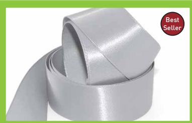
Silver Coin 920

Widths with extended lead times Approx 2-3 weeks 12mm, 15mm.