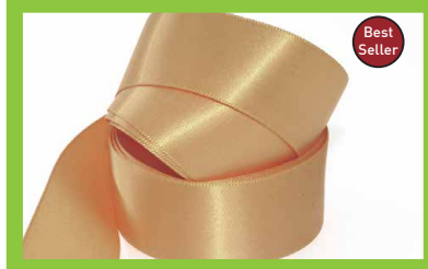
Sand Dune 150

Widths with extended lead times Approx 4-5 weeks 12mm, 15mm, 50mm