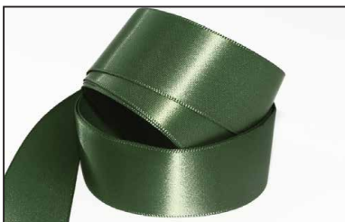
Village Green 750

Item can be dyed to order MOQ 5,000 Metres