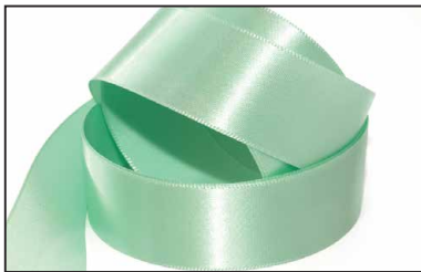
Eau De Nil 720

Widths with extended lead times Approx 4-5 weeks 12mm, 15mm, 50mm