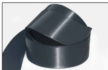
Dark Grey 970

Widths with extended lead times Approx 4-5 weeks 12mm, 15mm, 50mm