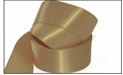
Gold Leaf 160

Widths with extended lead times Approx 2-3 weeks 12mm, 15mm.