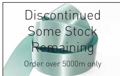
Angel Blue 705

Discontinued Some Stock Remaining Order over 5000m only